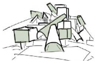
GUGGENHEIM ABU DHABI